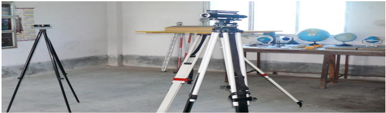
Figure 16 GEOGRAPHY LAB