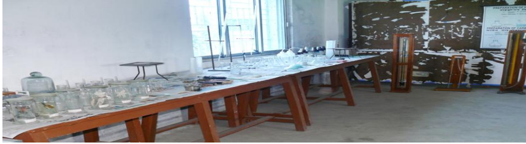
Figure 4 PHYSICAL SCIENCE LAB