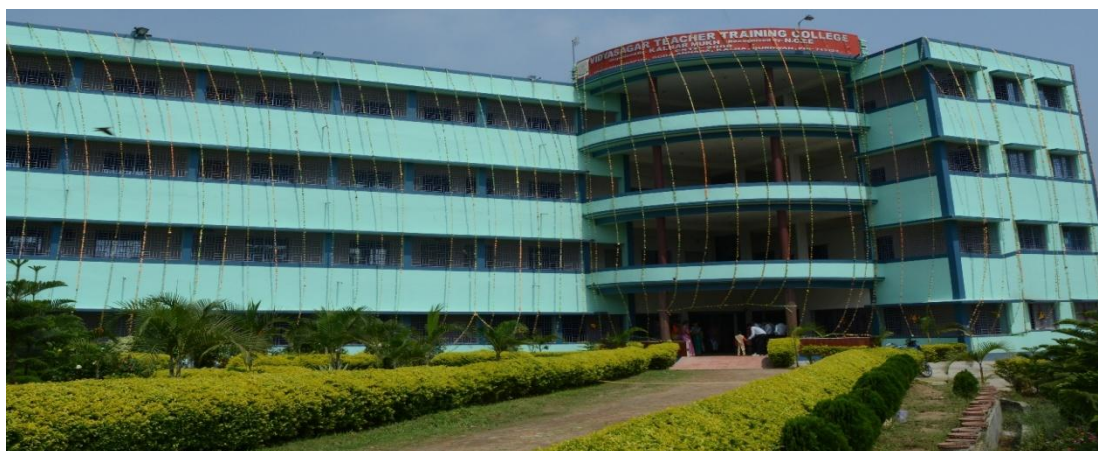
Figure 3 VTTC FRONT SCAPE