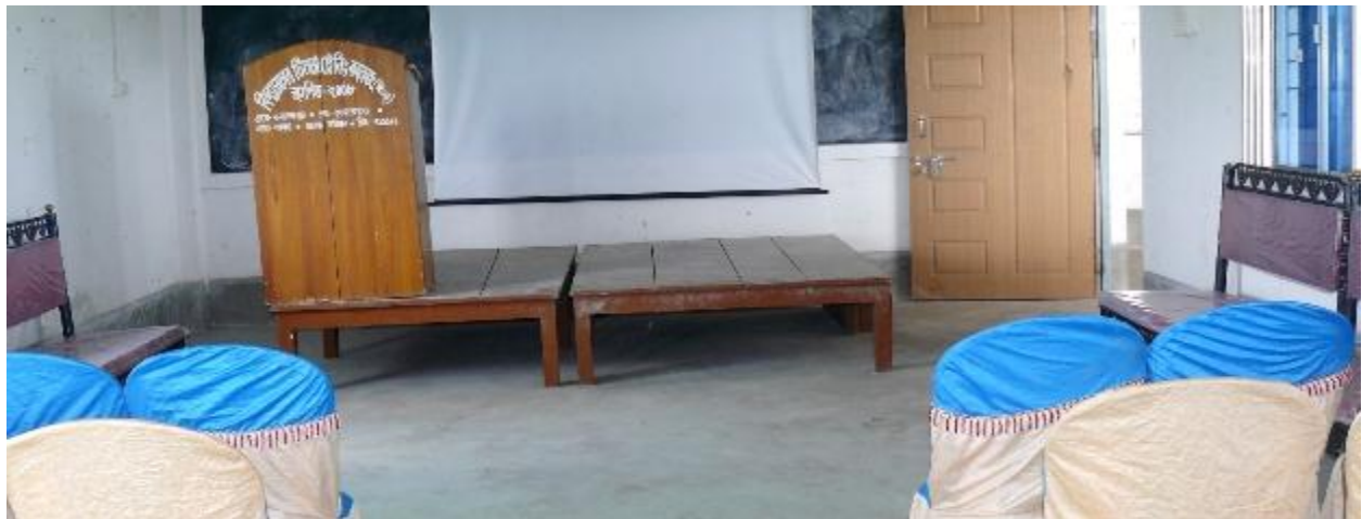
Figure 19 MULTIPURPOSE ROOM