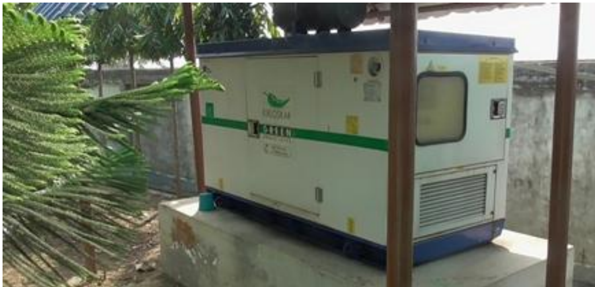
Figure 26 GENERATOR