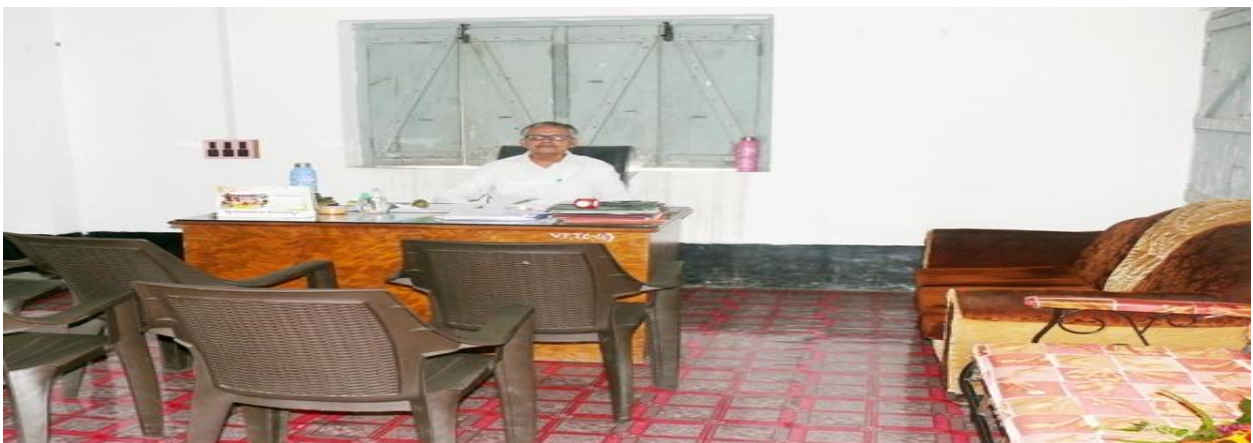
Figure 22 PRINCIPAL ROOM