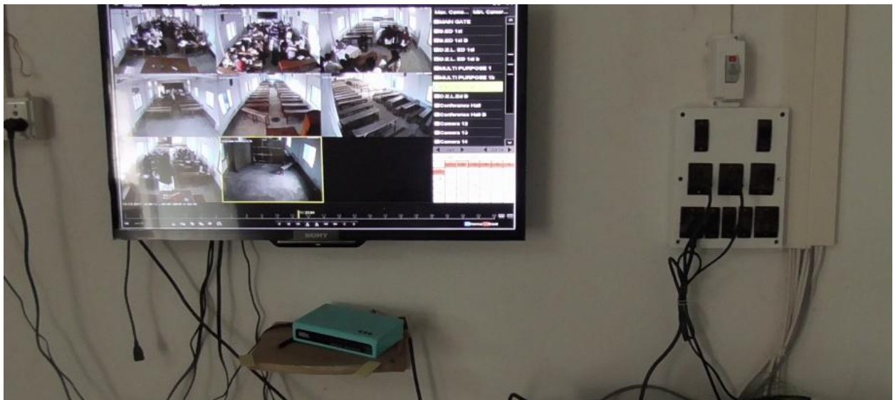
Figure 28 CC TV