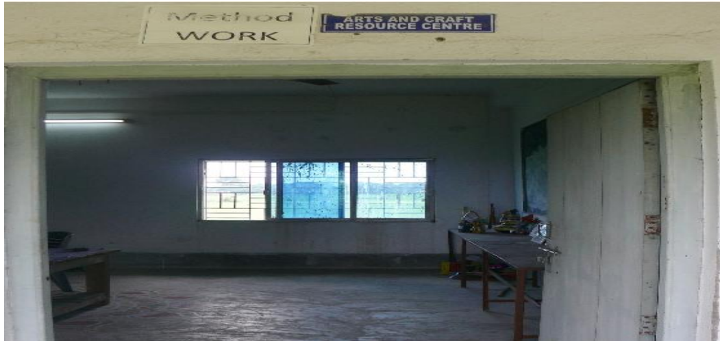
Figure 1 ART & CRAFT