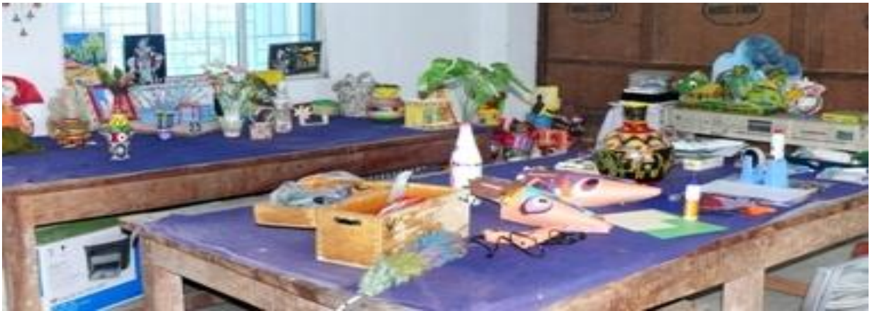
Figure 20 ART & CRAFT