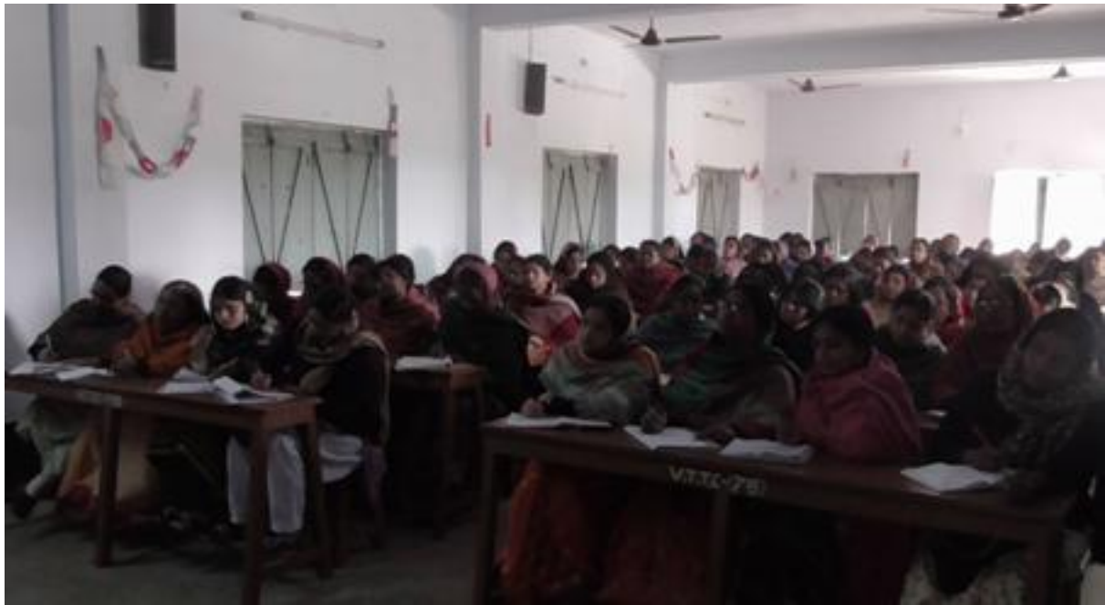
Figure 27 CLASS ROOM