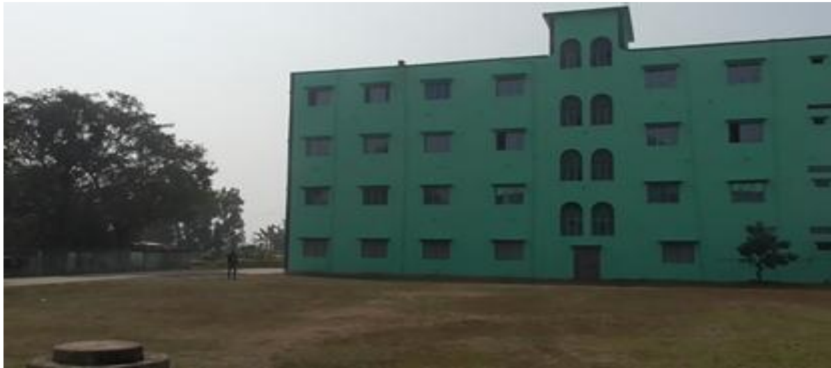
Figure 24 PLAY GROUND