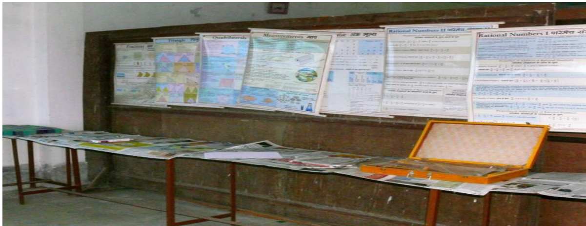
Figure 9 PSYCHOLOGICAL LAB