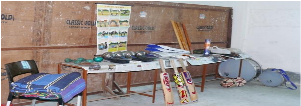
Figure 21 PHYSICAL EDUCATION ROOM