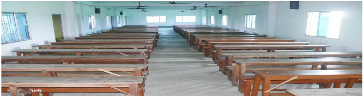
Figure 14 CLASS ROOM