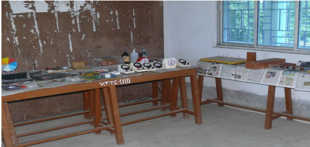
Figure 5 SCIENCE LAB