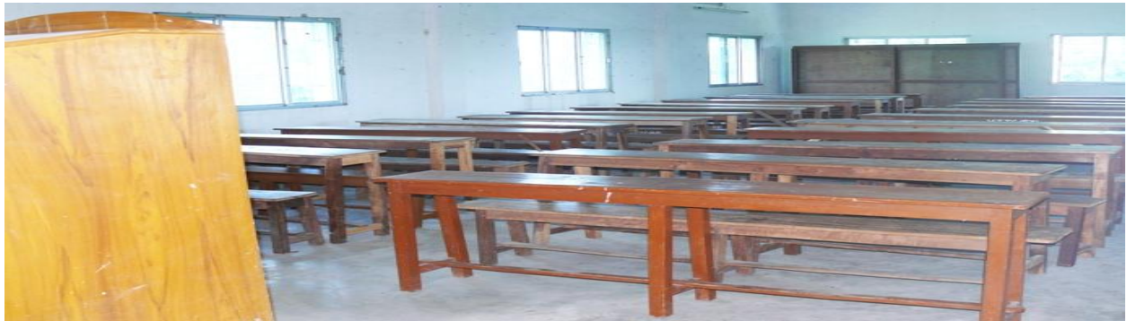
Figure 13 CLASS ROOM