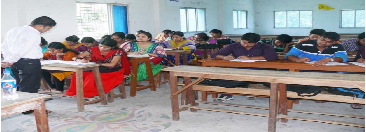
Figure 15 CLASS ROOM