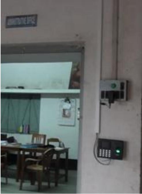
Figure 29 BIOMETRIC ATTENDENCE