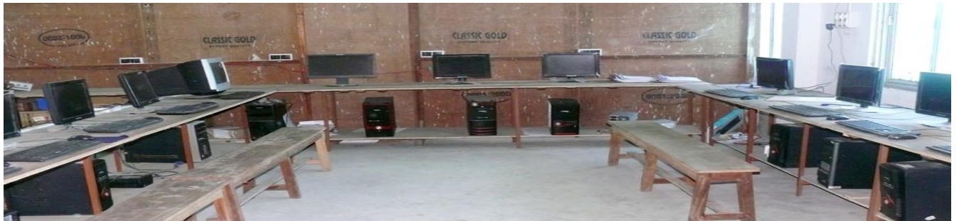
Figure 11 COMPUTER LAB