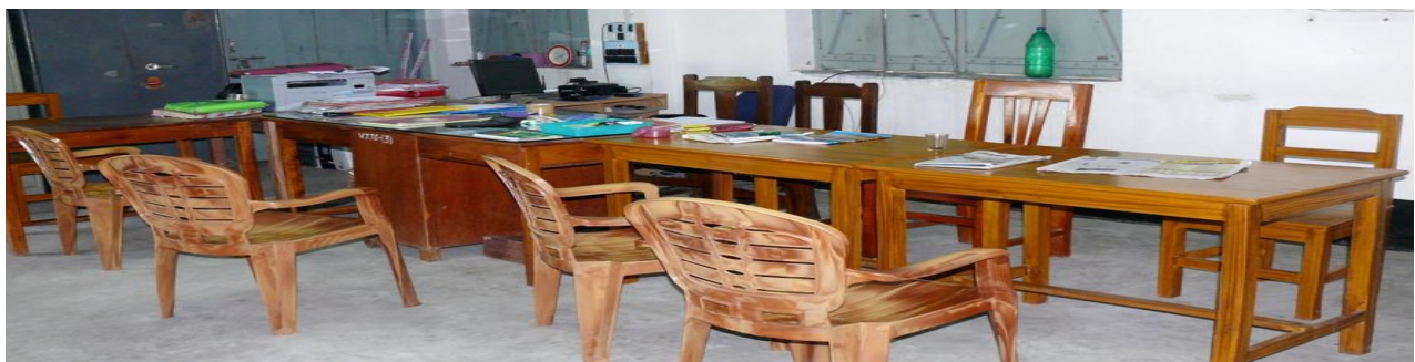
Figure 17 ADMINISTRATIVE ROOM