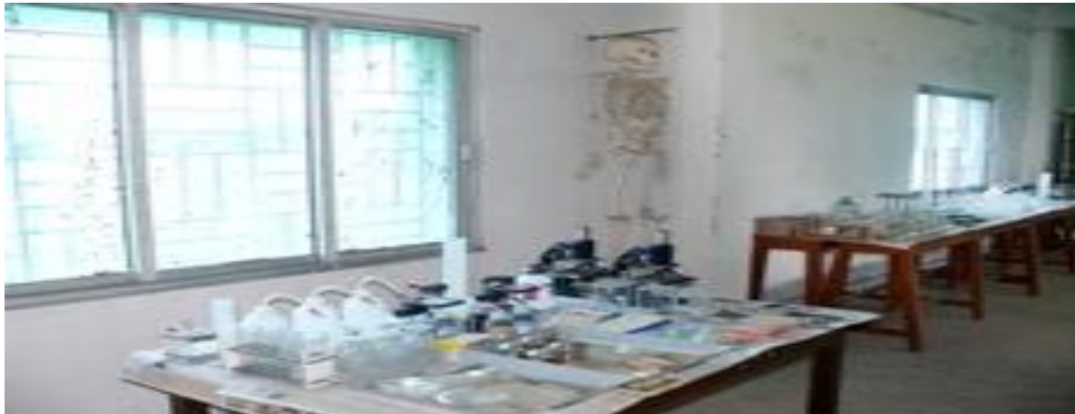
Figure 6 SCIENCE LAB