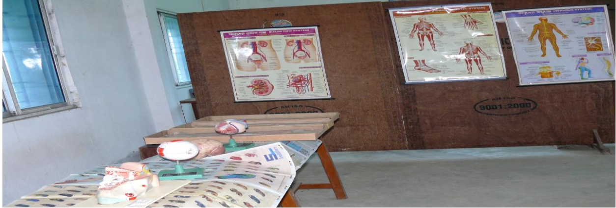
Figure 7 LANGUAGE LAB