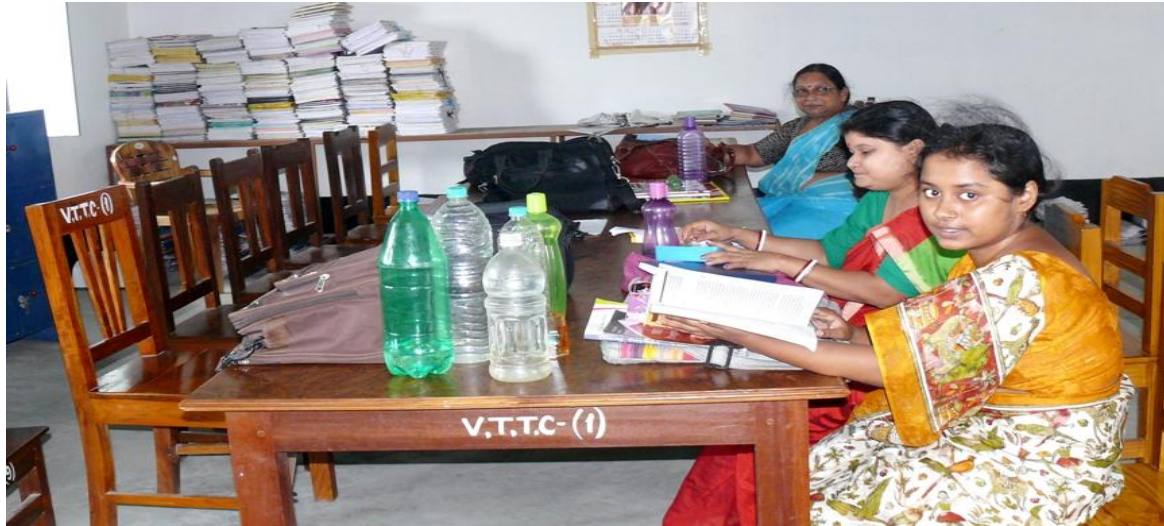
Figure 18 STAFF ROOM