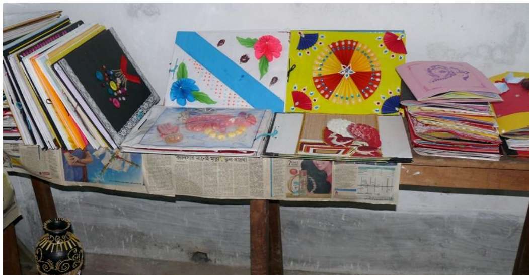
Figure 2 ART & CRAFT