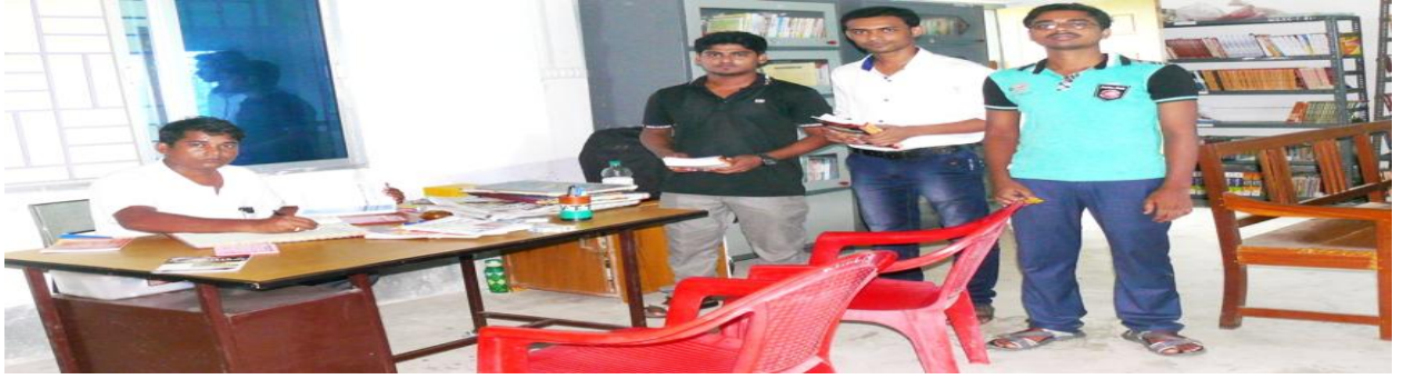
Figure 12 LIABRY