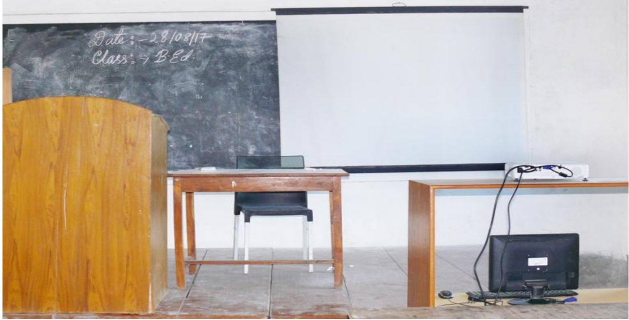
Figure 23 MULTIPURPOSE ROOM