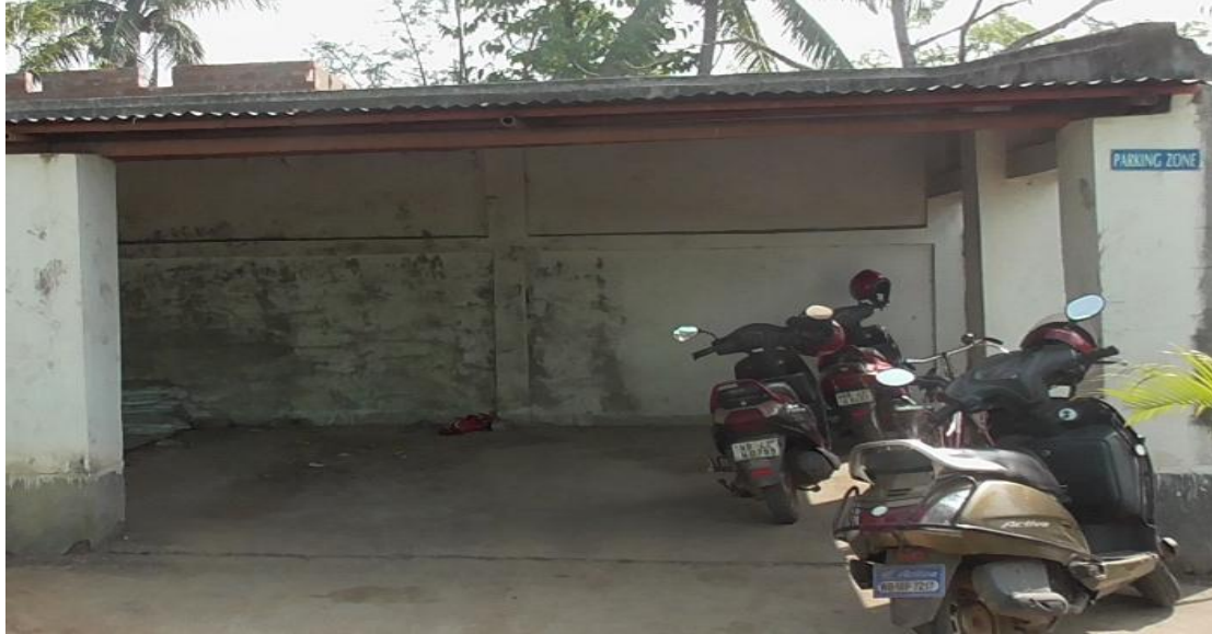
Figure 25 PARKING ZONE